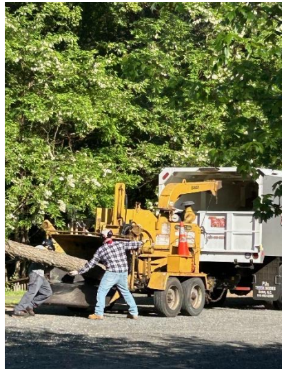
Tending our church home

If you have a picture you would like to share, send it to office@valechurch.org